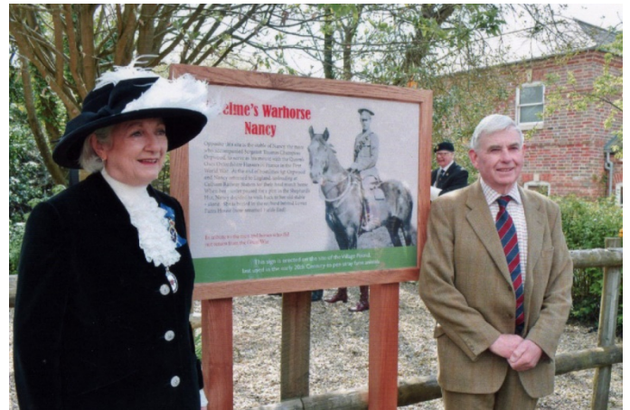
Unveiling of the memorial board in April 2019