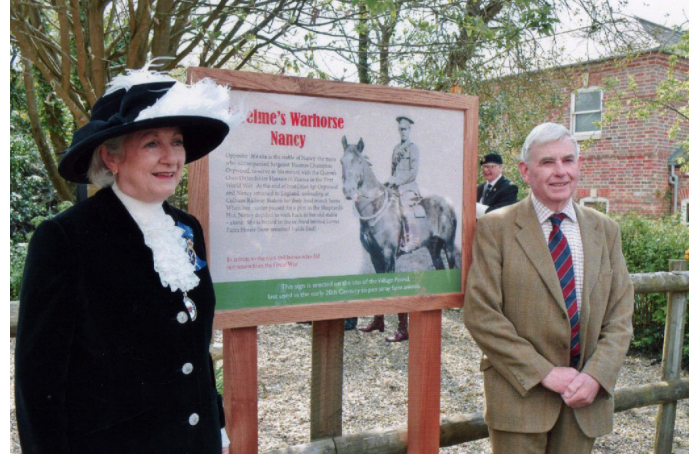
Unveiling of the memorial board in April 2019